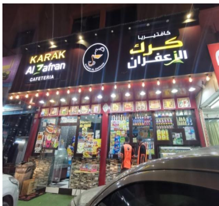
Figure 10: Karak Chai ( tea) Cafeteria.

The Karak Chai is a hot popular beverage for both Emiratis and expats alike. It is the most affordable hot beverage can everyone has in the UAE. Cardamom, Saffron, Cinnamon, Ginger, Sugar and milk are added to ground black tea and boiled several times for few minutes to prepare this popular beverage. Karak is the name adopted by UAE locals for this type of tea which means “strong or heavy” in Hindi language. Karak Chai has Indian origin but since 1960s, it has become a part of Emirati culture (Figure 10). In India, “Masala Chai” as it is called by Indians, is the traditional and the most popular hot drink. In America and some other countries, a similar beverage with milk is made and is called “Tea Lattes” (Diana, 1999).