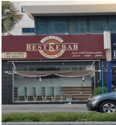
Figure 3: Iranian Restaurant in Bur Dubai (Satwa)

In Al Satwa, Several Indian restaurants are locating and considered part of the heritage of the city as the local Emirati cuisine is largely driven from Indian cuisine (Figs.5, 6). Indian cuisine is very popular in Dubai as Indian merchants and workers came to the city of Dubai in the 1920s as it has been illustrated previously (Kanna, 2011). Thus, restaurants serving Indian food are very popular and widely available in the UAE in general and Dubai particularly (Jayanthi, 2016).