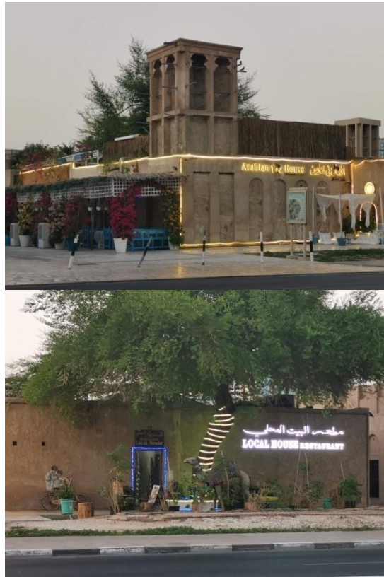
Figures 1,2: Traditional Restaurants in Al Fahidi Historical District (Bastakyya) - Bur Dubai.

Most of food tours in the city of Dubai are walking tours in old Dubai; Deira and Bur Dubai traditional neighbourhoods where the city of Dubai emerged and grew (Al Fahidi Historical District). In these areas the tourists can feel the real essence of the city (Figs. 1, 2). In this type of tours tourists enjoy walking through old houses and tasting the most ethnic traditional types of food and beverage in Dubai. Food tours in the city of Dubai show the cosmopolitan lifestyle of the city through food. In these tours the success of integrating various ethnic groups in one place can be shown (Elsheshtawy, 2010).