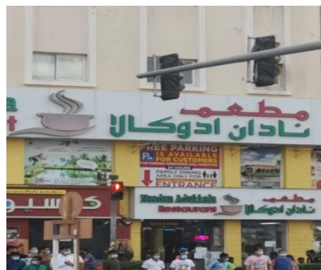
Figures 5, 6: Indian and Pakistani restaurants in Bur Dubai (Satwa).