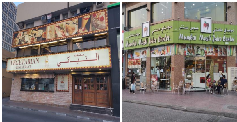
Figure12, 13: Indian Restaurant and Cafeteria - Bur Dubai