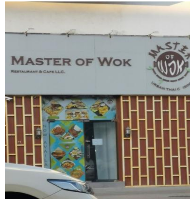
Figure 4: Asian Restaurant in Bur Dubai (Satwa)

To maintain the traditional Emirati cuisines Dubai has some local restaurants offer wide variety of Emirati ethnic foods (Khalaf, 2001) such as Al Fanar restaurant which has authentic Emirati cuisine and an architectural style reflects the old houses of Dubai. Therefore, it is commonly included in food tours of Dubai to enjoy local food with the old Dubai authentic ambience.